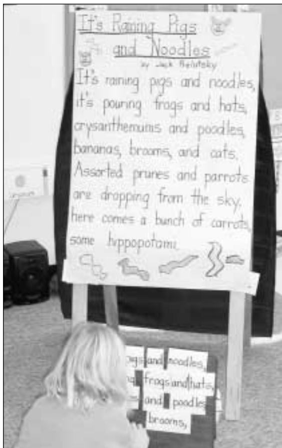
Pocket Chart Center