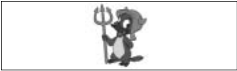
Figure 0.3 This is Hexley, the mascot/logo for Darwin. Darwin is the name of the version of Unix used as the foundation of Mac OS X.

The icon at right is used to indicate a Unix feature that occurs only in Mac OS X. For example, there are some Unix tools included with Mac OS X for dealing with files created by older Mac applications, but these tools are not standard parts of any other version of Unix.