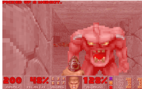
Doom II, level 2.

If we then play an action-based computer game like Doom II (ID Software 1994), it is hard to find a distance between story time, narrative time, and reading/viewing time. We may find a representation, and as a player you try to reconstruct some events from this representation: The blocky graphics can be interpreted so far as the player controls a character, whose facial expression is represented in the bottom centre. On the illustration this person has been cornered by a large pink monster, whose hostile intents are clearly identifiable. Players are attacked by monsters; puzzles must be solved to get to the next level.