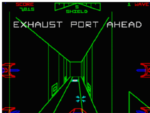
Star Wars (Atari 1983)

The primary thing that encourages the player to connect game and movie is the title "Star Wars" on the machine and on the screen. If we imagine the title removed from the game, the connection would not be at all obvious. It would be a game where one should hit an "exhaust port" (or simply a square), and the player could note a similarity with a scene in Star Wars, but you would not be able to reconstruct the events in the movie from the game. The prehistory is missing, the rest of the movie, all personal relations. Possibly we are even missing the understanding that we are fighting a death star (whatever that is). Finally the most obvious: If you do not complete the mission, this is unlike the movie; if you complete the mission, another death star appears - which is also unlike the movie.